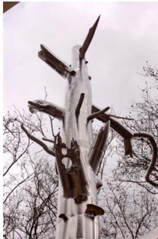
Roxy Paine detail of Defunct , 2004 stainless steel Approx. 47' high