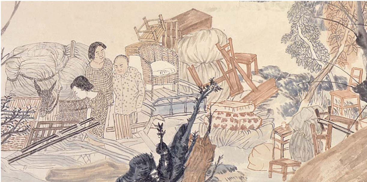
YUN-FEI JI Water Rising , detail, 2006, mineral pigments and ink on mulberry paper, 22 1/2 X 450 inches