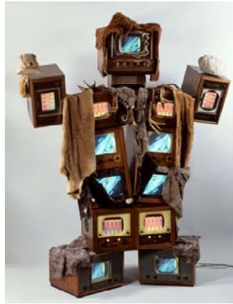
Nam June Paik From Neander Valley to Silicon Valley , 1994 mixed media 112 x 92 x 34 inches