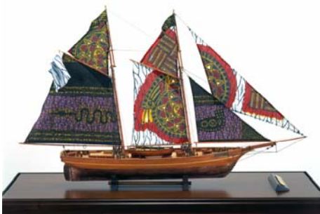
Yinka Shonibare, MBE Wanderer , 2006 wood, plexiglas, fabric, brass Edition 8/8 67 ¾ x 48 x 17 ¼ inches