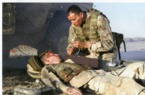
Four stills from The Casting , 2007.

film that followed The Casting , similarly features a restaging of an event described in an interview (in this case, a suicide bombing at a Jerusalem falafel shop), cross- and counter-cut with "behind-the-scenes" shots of the cast and crew. Instead of the tableaux vivants of The Casting , the scenes are fully acted out, with actors and crew shot together in motion, though it's unclear whether the crew members pictured are really the ones who made the film or yet more actors.