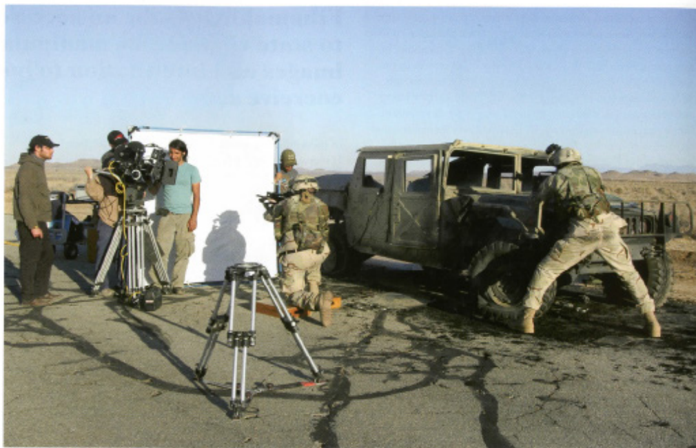
Production still from The Casting , 2007, video, 18-minute loop.

Thus Fast shows how, both in its production and in its effects, filmmaking can use memory and history to command political and economic power in the present.