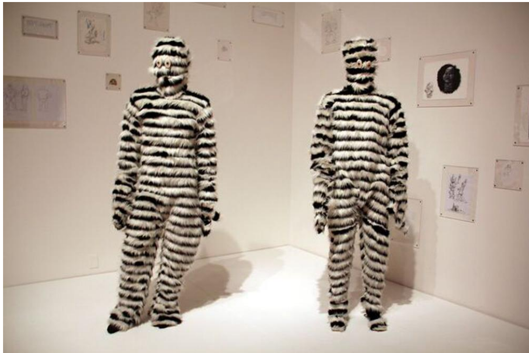
Trenton Doyle Hancock, "Bringback Figure Costume #1 and Costume #2," 2014.