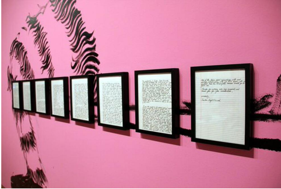
Trenton Doyle Hancock, "What the Bringback Brought, Letter to the Greenfield Prize Selection Committee at the Hermitage Artist Retreat," 2014.

The context of Trenton Doyle Hancock's past exhibitions weighs heavily on his present. With Hancock's epic fiction circling the creatures known as Mounds, each successive exhibition often builds upon the narrative of the preceding one, becoming a segment of a larger story. This is true to the extent that the progression of his practice is largely conflated with the progression of the narrative. It can account for the reason Hancock's 2012 solo exhibition at James Cohan Gallery, ...And Then It All Came Back To Me , was particularly conspicuous at the time, and feels, regrettably, anomalous now.