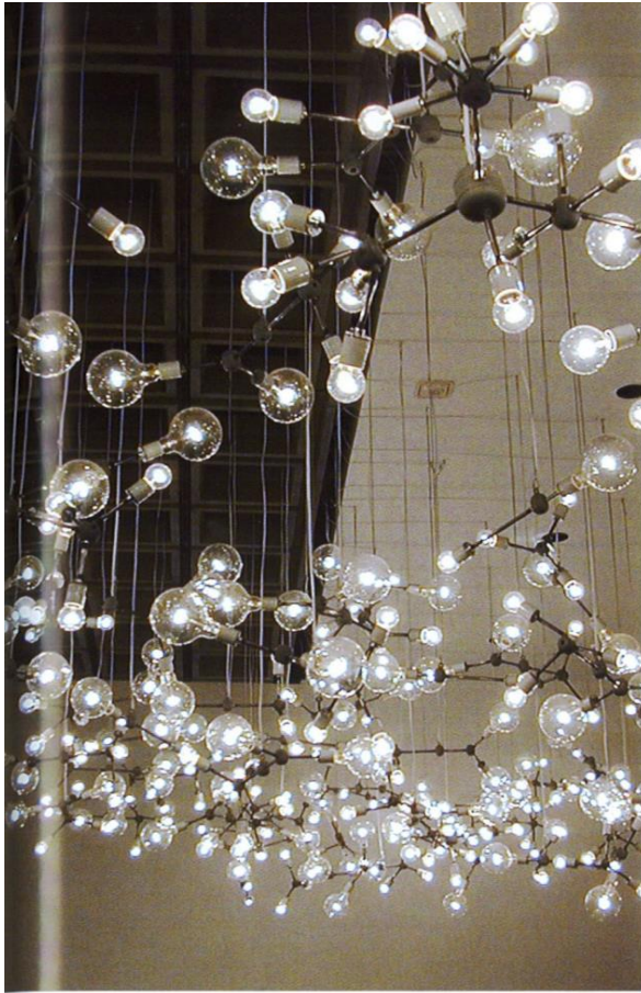
Night Sky (Over the Painted Desert, Arizona, January 11, 2004)

“Spencer makes these very beautiful attempts to capture something that seems miraculous, while acknowledging that it’s impossible,” Cross says. “But he has that same ambition to reach the sun.”