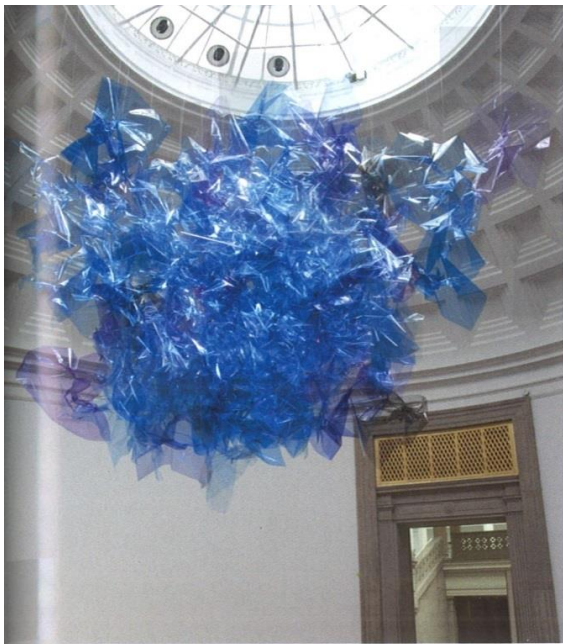
▲ Sunlight in an Empty Room (Passing Cloud for Emily Dickinson, Amherst, MA, August 28, 2004) Indianapolis Museum of Art (2013)