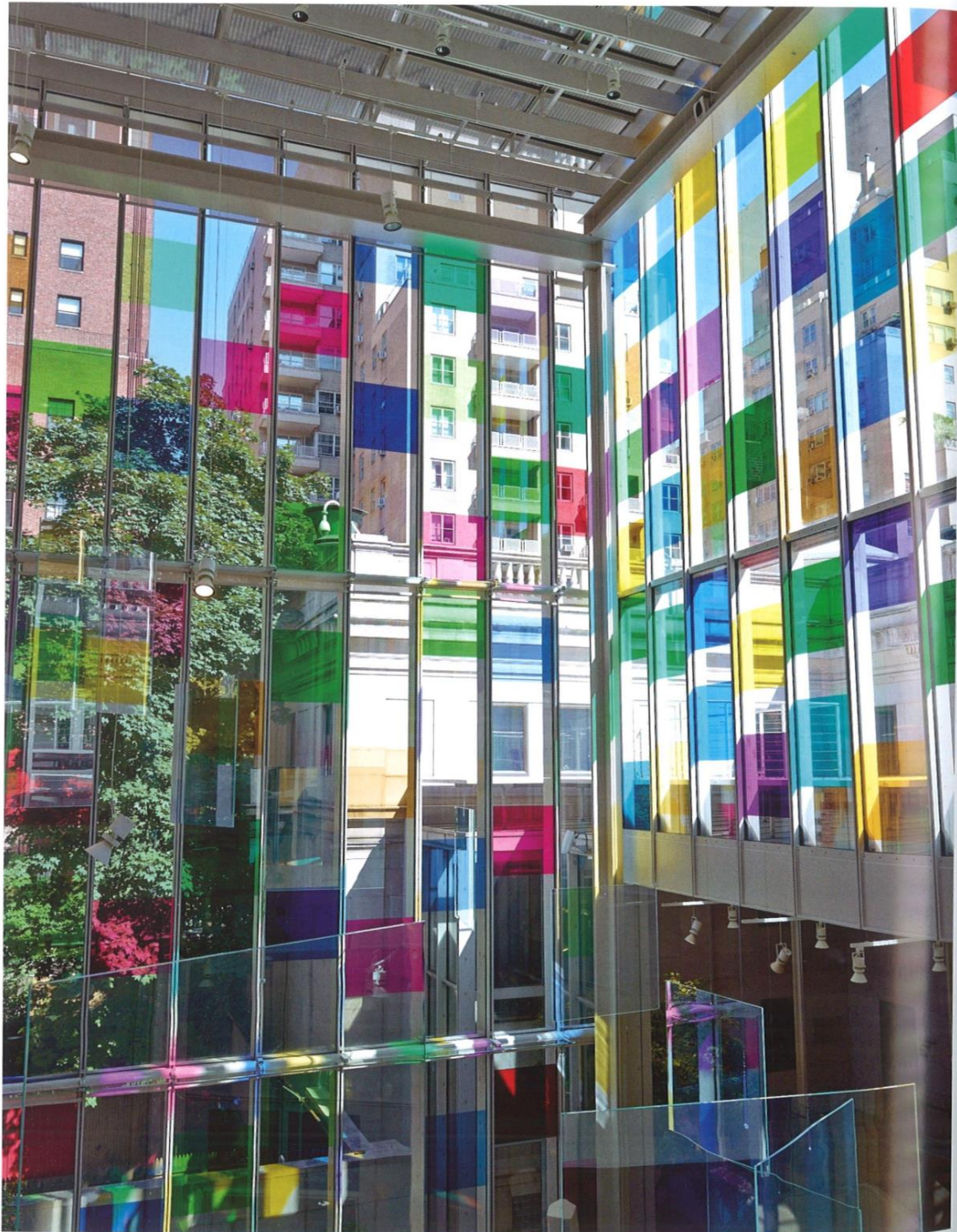
▲ A Certain Slant of Light

The Morgan Library & Museum, New York City (2014)