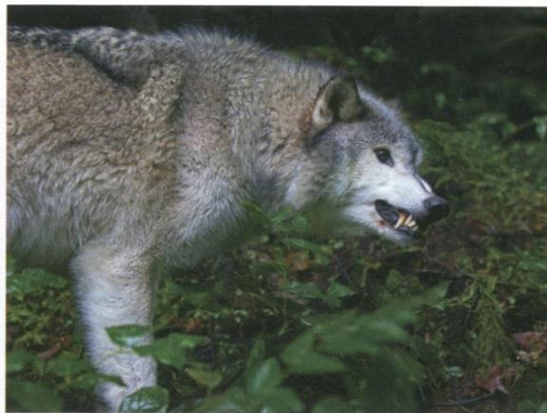
Anton Ginzburg, from the "Hyperborea" series, 2011, archival ink-jet print, 20" x 26". Blaffer Art Museum.

Part one of the trilogy, At the Back of the North Wind (2011), first shown at the 54th Venice Biennale, was a semi-fictional, semi-documentary account of Ginzburg's quest to find Hyperborea, a