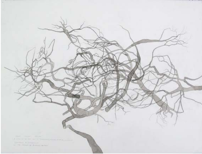
Roxy Paine, Drawing for Maelstrom , 2008, India ink on paper, 22.5 x 30 inches